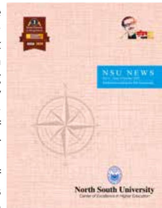
NSU News Cover October 2020